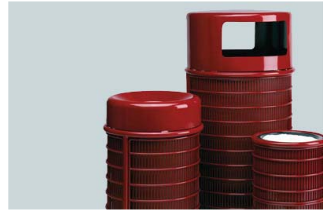
PLEXUS TRASH AND RECYCLE RECEPTACLES - OCEAN