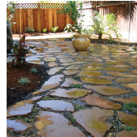
URBANITE & CRUSHED STONE PAVING