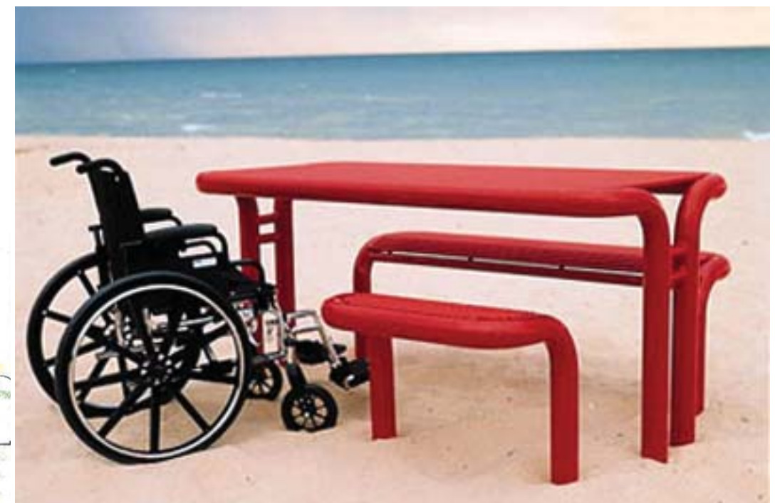
PETROFSKY ACCESSIBLE PICNIC TABLE - OCEAN