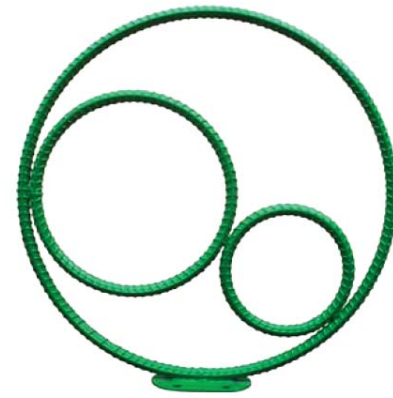
DERO 'RECYCLE' BIKE RACK - GRAY