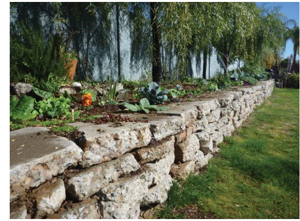
URBANITE RETAINING SEATWALLS